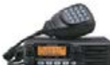
TM-281A 2 Mtr Mobile