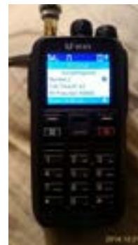
Connect Systems CS580